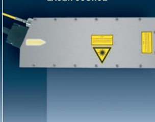
OEM - LASER SOURCE