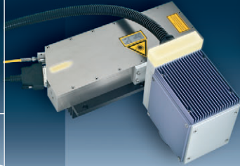
HIGH - RESOLUTION GALVO SYSTEM